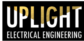
Uplight Electrical Engineering