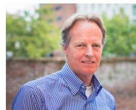
Gregg D. Ander LLC