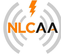
National Lighting Contractors Association of America