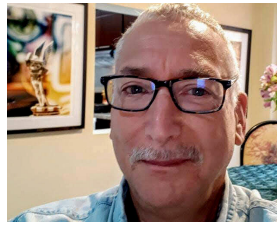
Phil Hall Images & Light